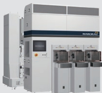
Single Wafer Plasma Nitridation / Oxidation System