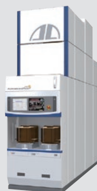
Batch Thermal Processing System