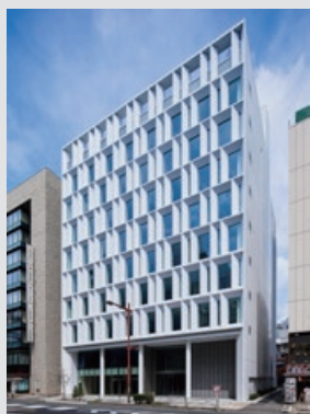
Head office (5th Floor, oak Kanda Kajicho)

Name KOKUSAI ELECTRIC CORPORATION Address of Head office 3-4 Kandakaji-cho, Chiyoda-ku, Tokyo 101-0045, Japan Established February 2, 2017 Paid-in Capital ¥100 million Number of employees 1,897 (consolidated)