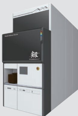
High-quality & High-performance Thermal Processing System