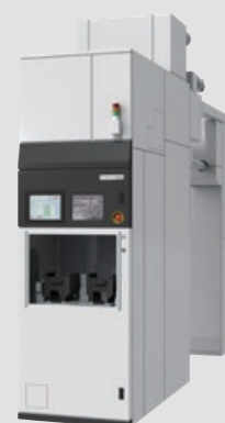
Batch Thermal Processing System for 200mm Wafers