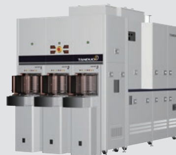
Single Wafer Annealing System